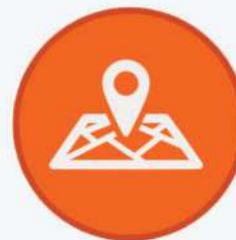
REALTIME GPS UPDATES